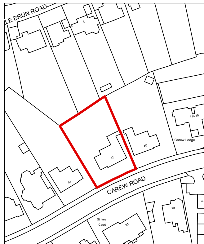
1:1250 Existing Site Location Plan