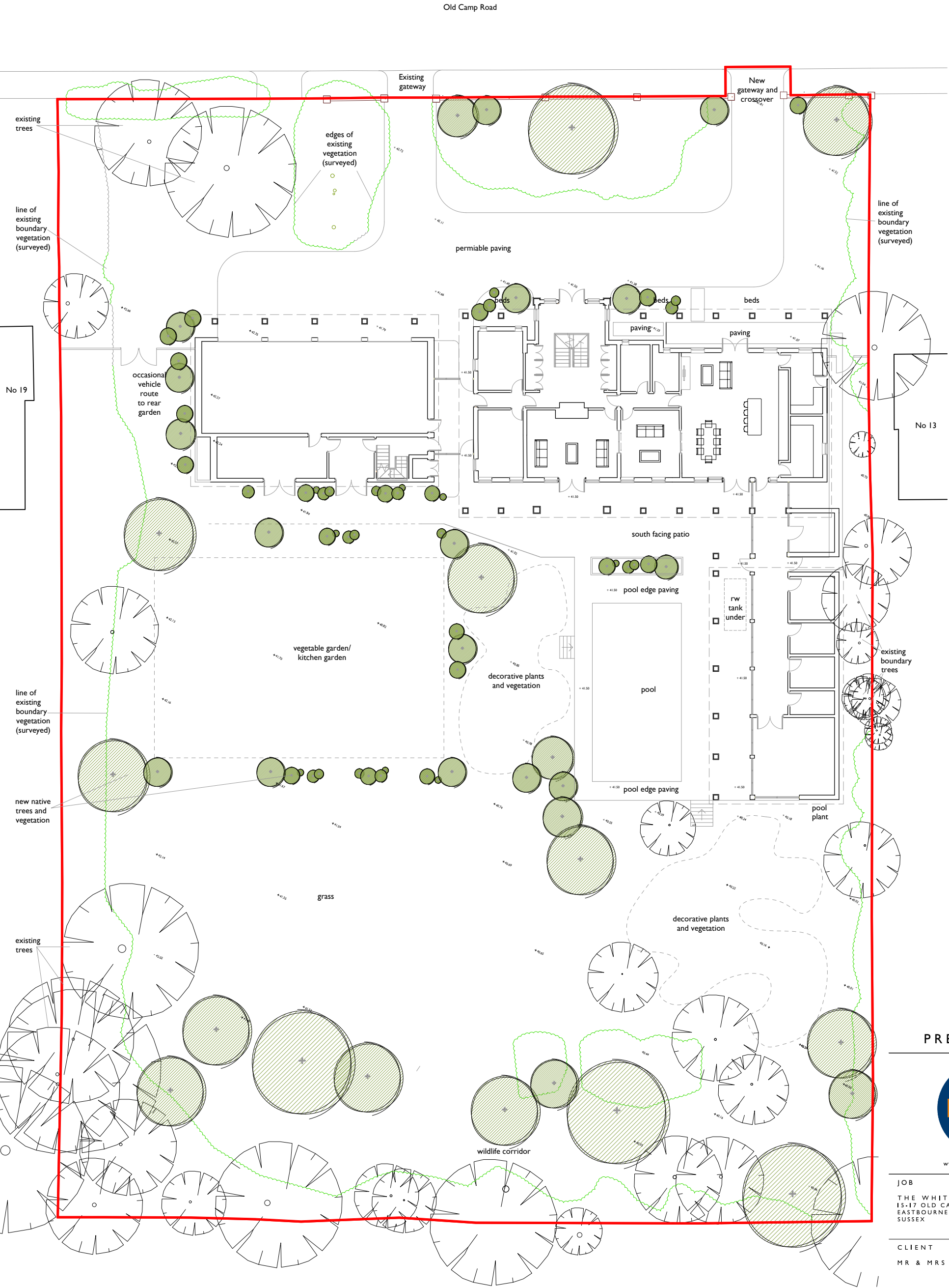
+LP Proposed Indicative Landscape Plan - scale 1:250 at A3