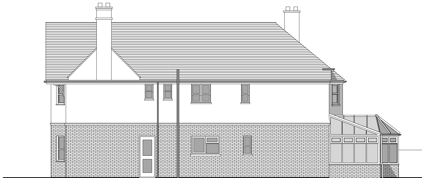
01 Side Elevation As existing