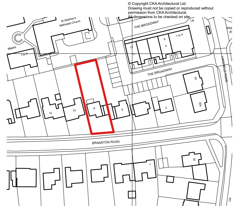
1:1250 Location Plan