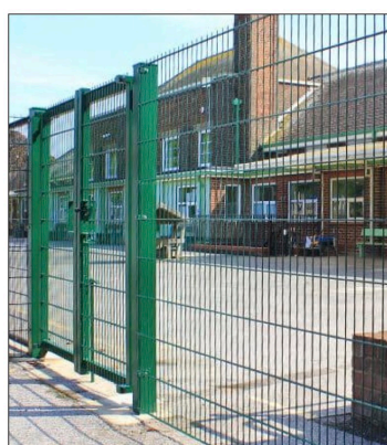
Example of welded mesh panel fencing

All new metal fencing, including the height, colour and timber privacy panels, will match the existing metal fencing at Sorrel Drive Children's Resource Centre.