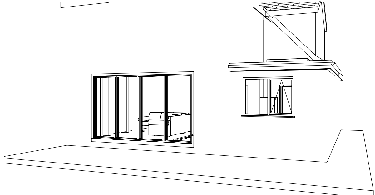
4 | 3D VIEW 2 Not to Scale